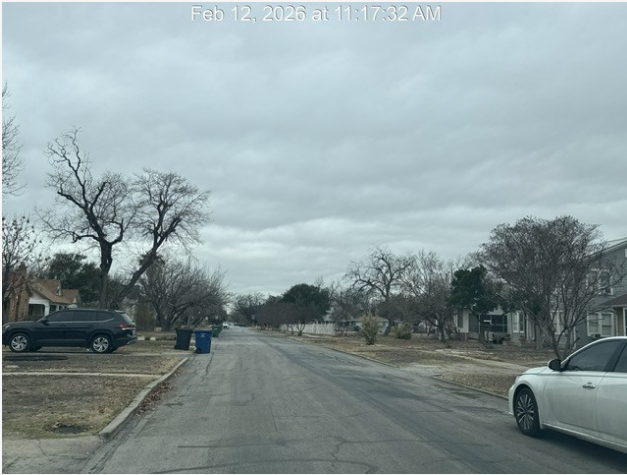
Subject Street Photo