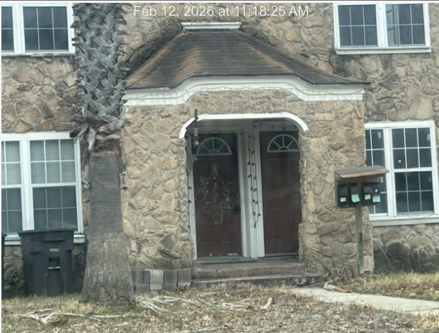
Subject Address Photo