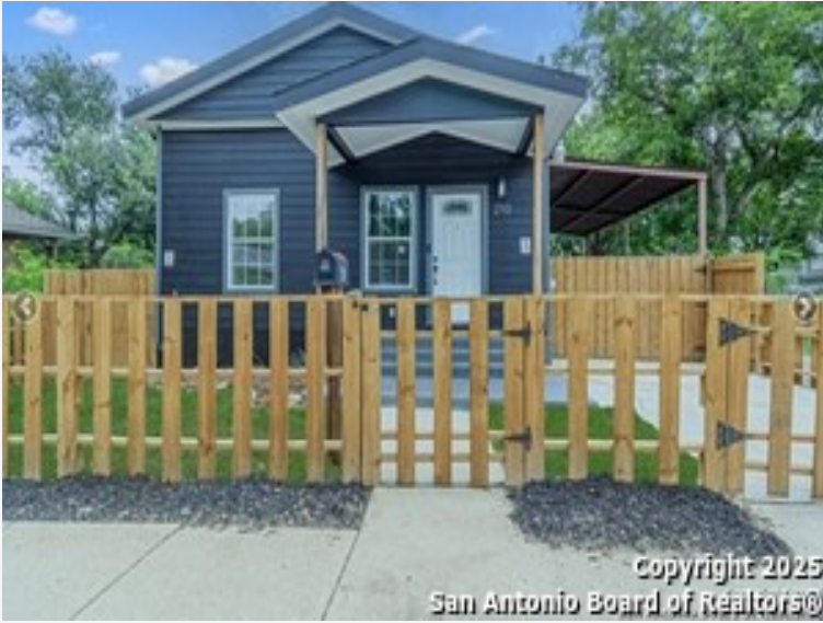
List 1 Photo