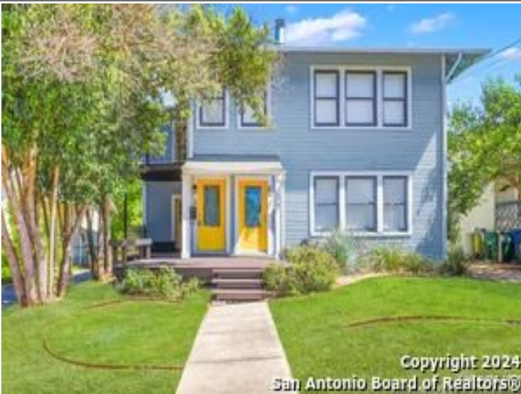
437 Queen Anne Ct