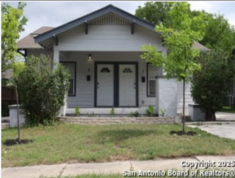
1317 W French Place