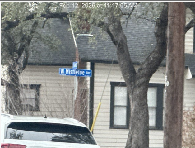
Subject Rear Photo