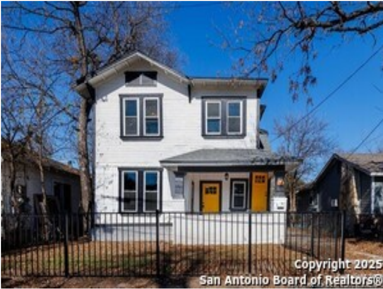
List 2 Photo