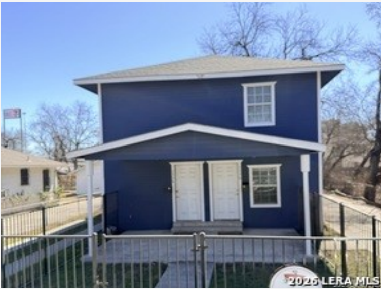
List 3 Photo