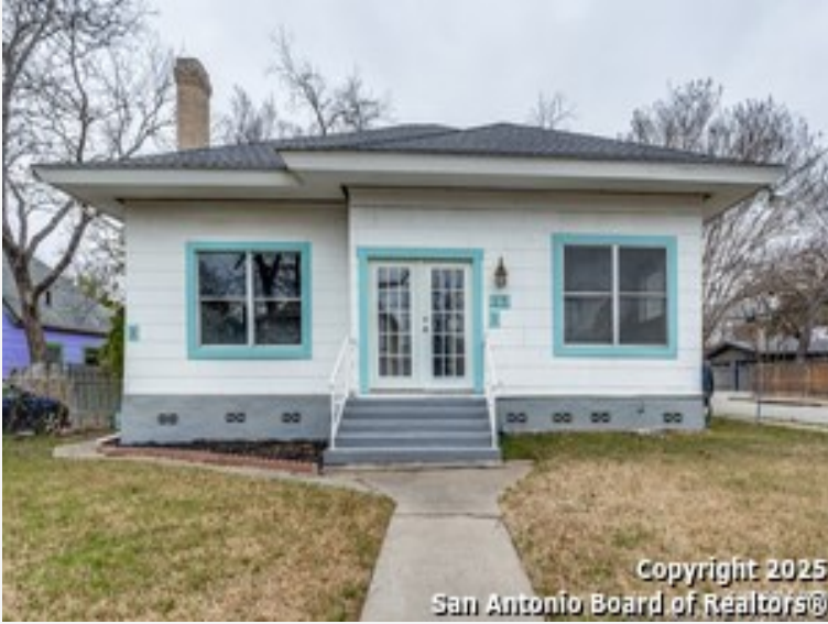
215 Queen Anne