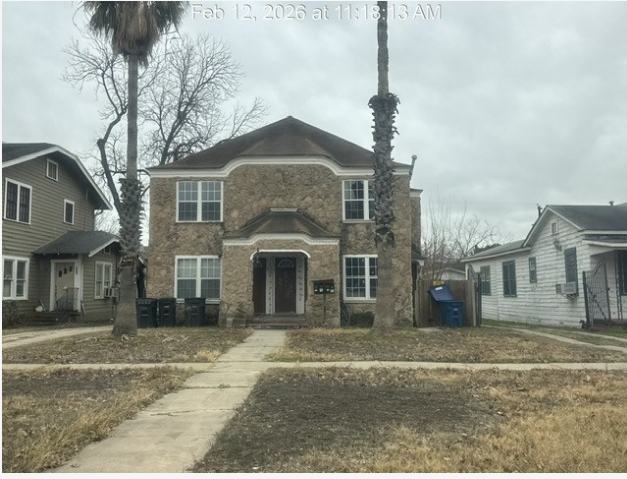
Subject Front Photo