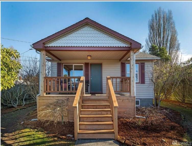
List 2 Photo