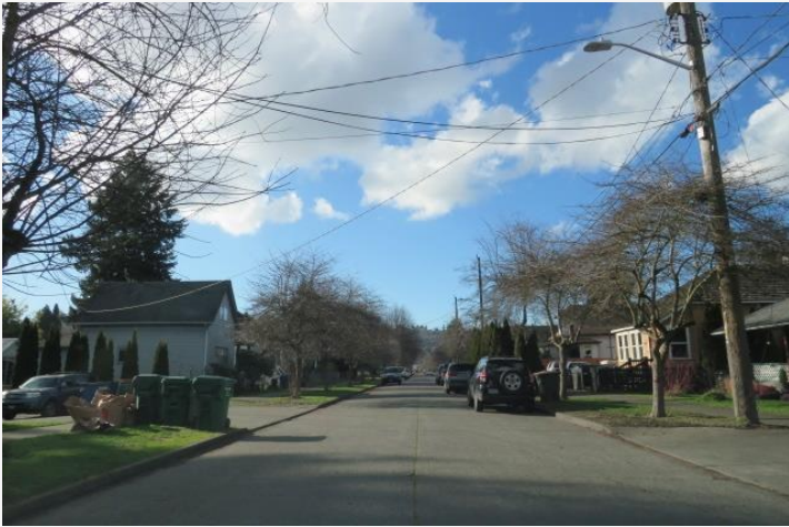
Subject Street Photo