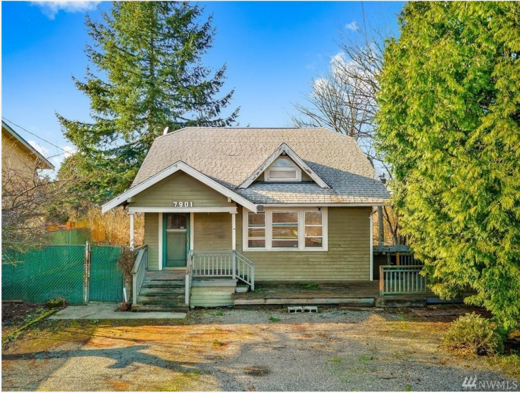
List 1 Photo