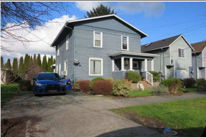
Subject Rear Photo