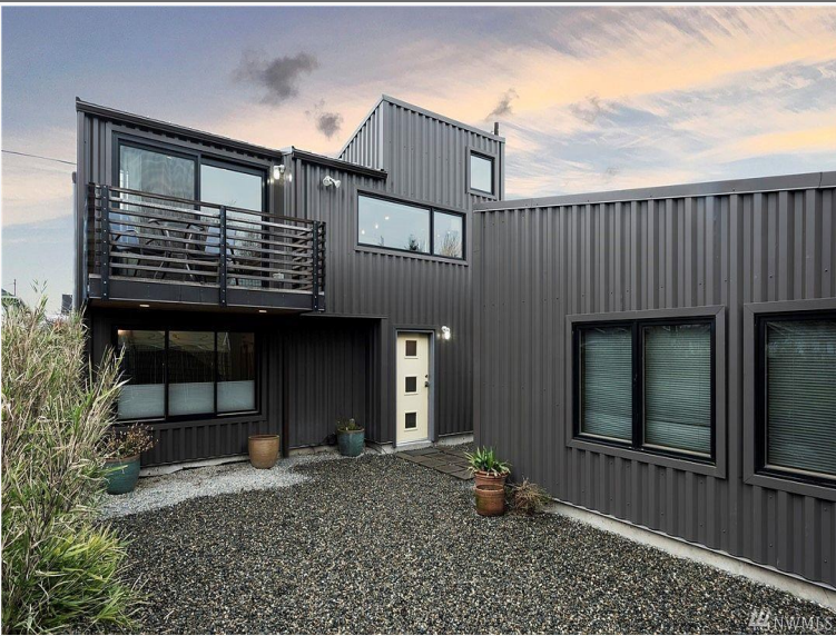
Sale 2 Photo