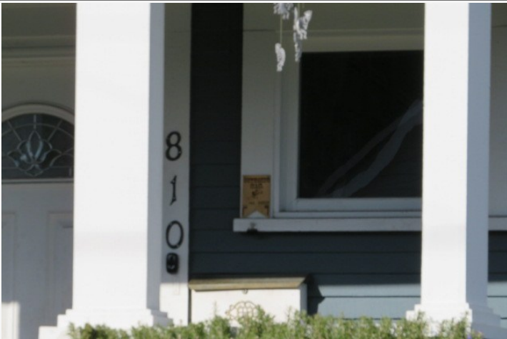
Subject Address Photo