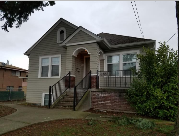
Rental 3 Photo