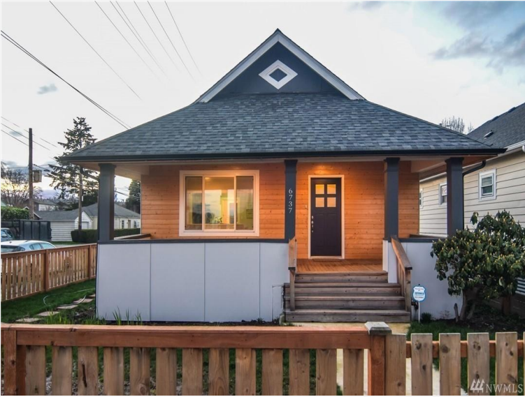
Sale 1 Photo