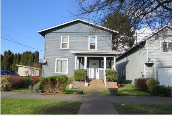
Subject Front Photo