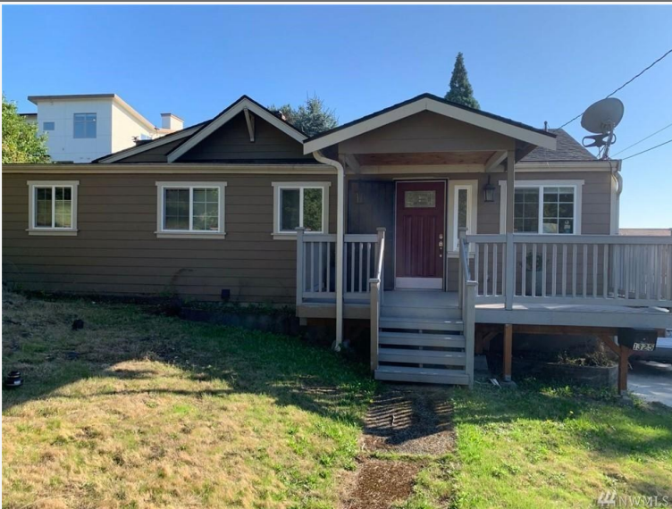
List 3 Photo