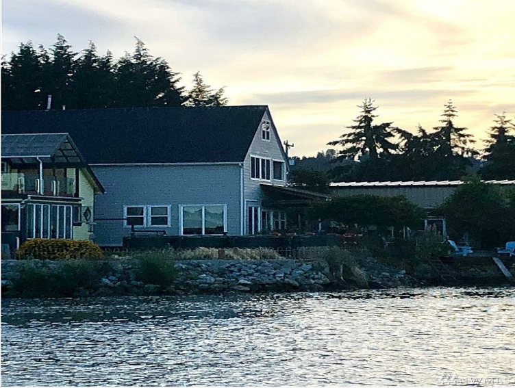
Rental 1 Photo