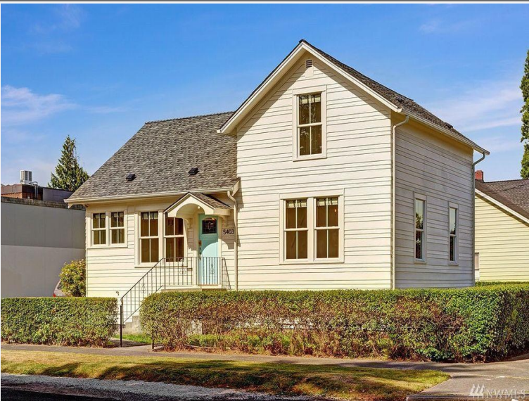
Rental 2 Photo