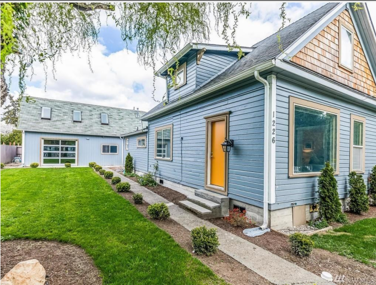
Sale 3 Photo