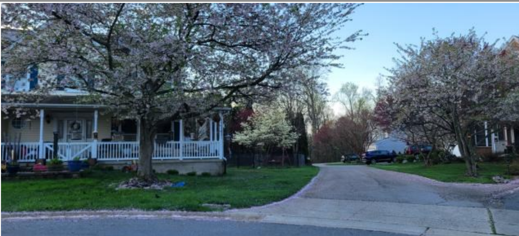
Subject Rear Photo