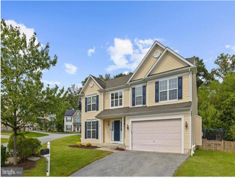
Sale 1 Photo