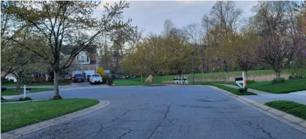
Subject Street Photo