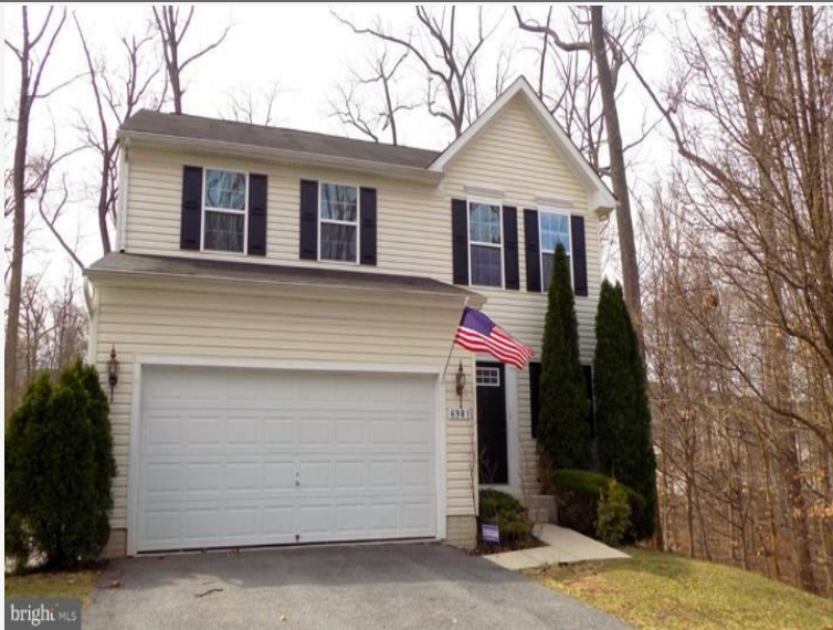
List 2 Photo