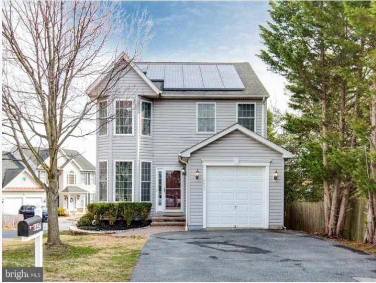
List 1 Photo