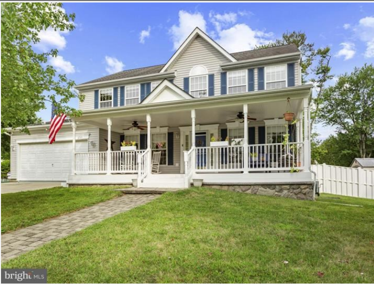
Sale 2 Photo