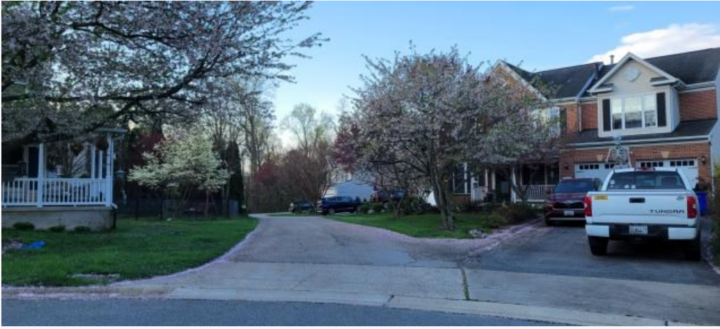
Subject Front Photo