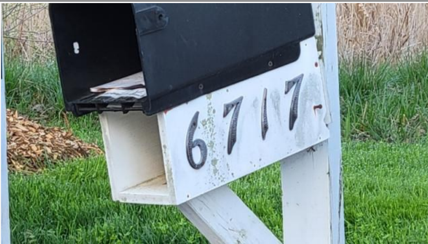
Subject Address Photo