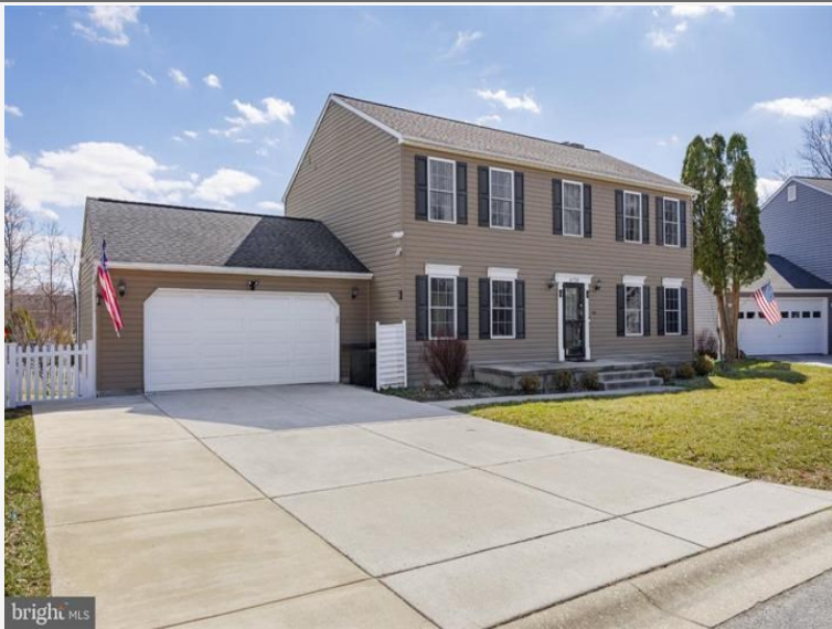
List 3 Photo