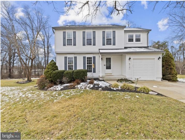
Sale 3 Photo