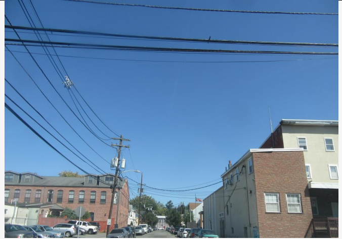
front view across street