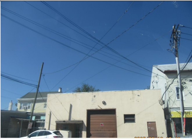
building on left side