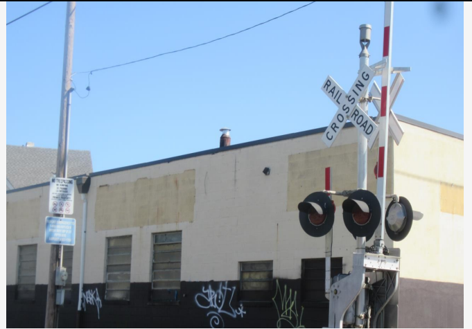
railroad trax 1 block away