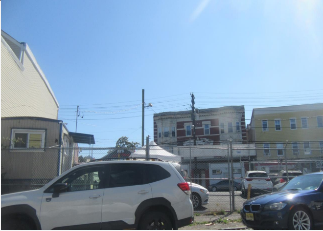
front view across street