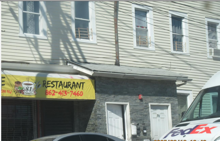
Subject Address Photo