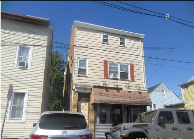
building on right