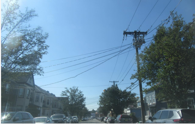
Subject Street Photo