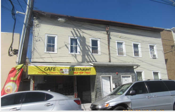
Subject Front Photo