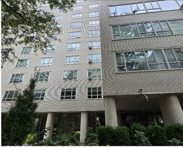
Subject Front Photo