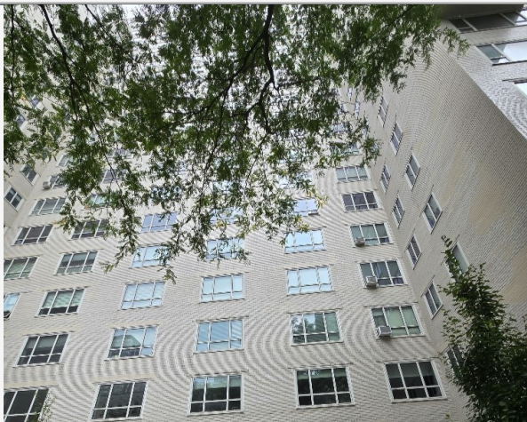
Subject Rear Photo