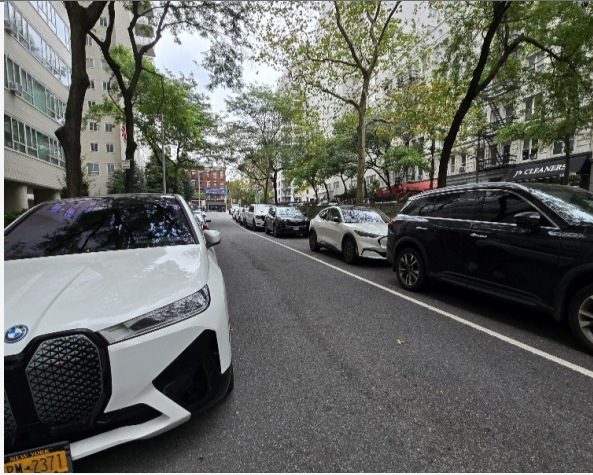
Subject Street Photo