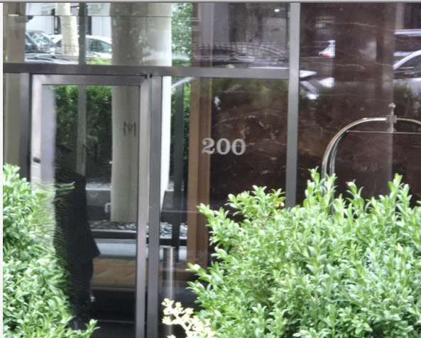
Subject Address Photo